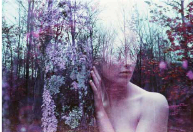
AMANDA CHARCHIAN, Nobody Quite Knows What to Make of the Moon Anymore , 2013, Digital C print

The show is only up through September 20th, so hurry up and go check it out. The space is open by appointment only. Contact simmy@simmyswinder.com for further information. 4619 W Washington Blvd. Los Angeles, CA 90016