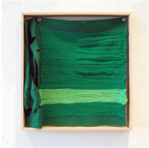
ARIEL HERWITZ, All of the Same, Greens, 2013, Felt, wool, cotton floss, maple frame