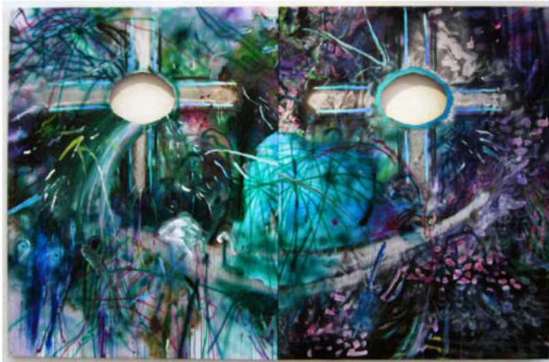
LISA SOLBERG, The End , 2014, Oil and acrylic on canvas