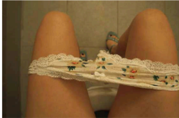
ALLIE POHL, Sotheby's Auction House, 2012, Archival Print