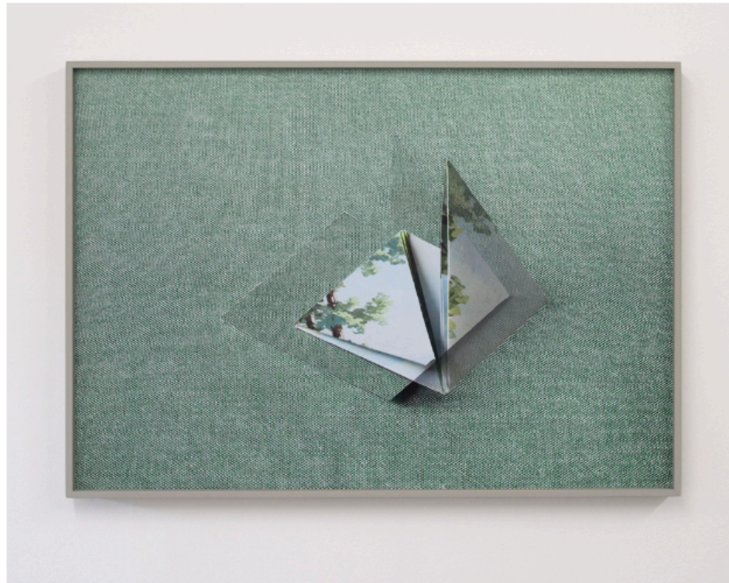
MIRIAM BÖHM Match VIII , 2012 Chromogenic color print 23.5 x 33.5 inches

March 1 - April 12, 2014 | Press Release | Images