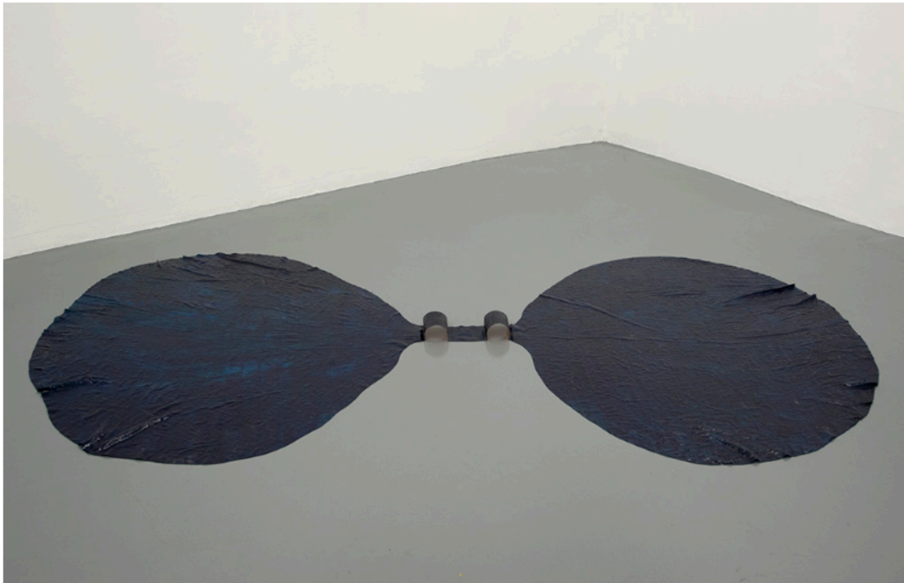
INDIA LAWRENCE Anklets for Transposal , 2014 Hand-dyed linen, ink, acrylic polymer, copper 102 x 54 x 2.25 inches Courtesy of the Artist

March 1 - April 12, 2014 | Press Release | Images