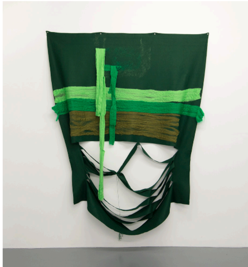
ARIEL HERWITZ All of the same, Green, 2014 Felt, wool, cotton floss 92 x 68 inches Courtesy of the Artist

March 1 - April 12, 2014 | Press Release | Images